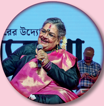
Padma Bhushan Usha Uthup Eminent Singer

A bha Surgy Centre Presents Anyatama Awards 2025 is an extremely moving and emotional initiative. This award reinforces the saying that women are capable of doing anything and perhaps a little better! I feel that both men and women work together to eradicate the issues that women still face.